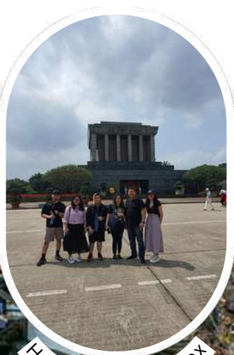
Ho Chi Minh Complex

Suggested flight: PR-596 HAN MNL 02:40 07:00 (Airfares excluded)