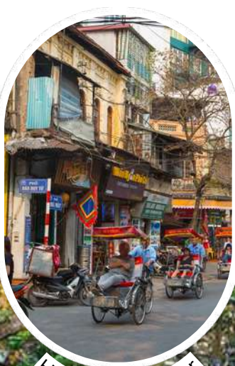
Hanoi Old Quarter