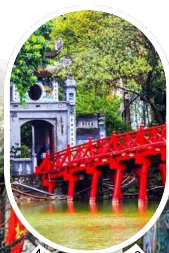
Ngoc Son Temple